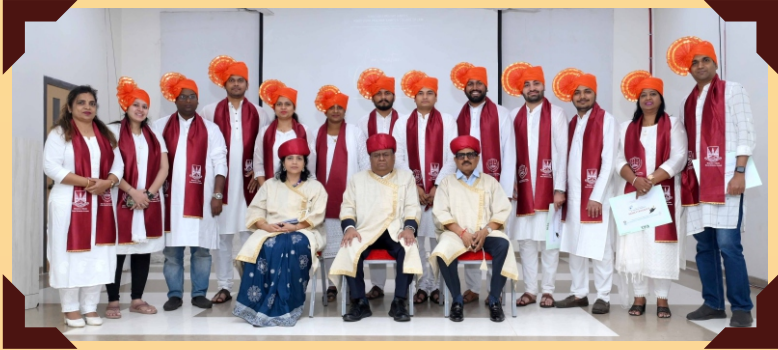
Hon'ble Justice Milind Jadhav (Bombay High Court) delivered a keynote-address at the Convocation ceremony