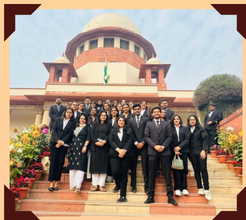
SUPREME COURT VISIT