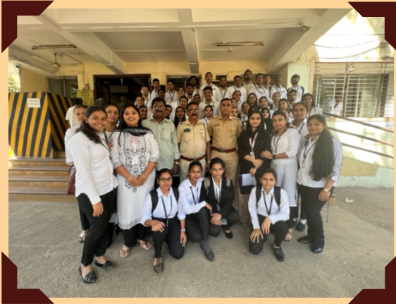
POLICE STATION VISIT