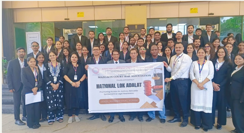
LOK ADALAT VISIT