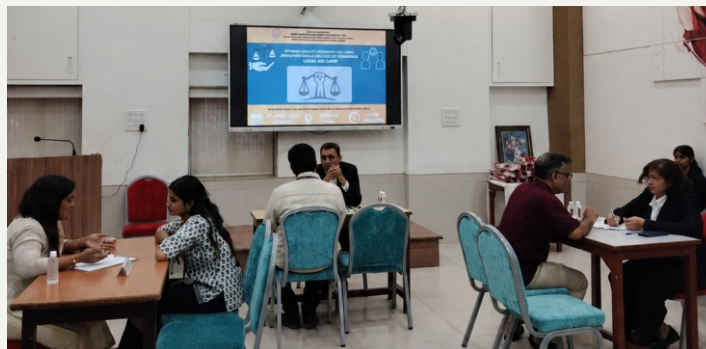
LEGAL AID CAMP