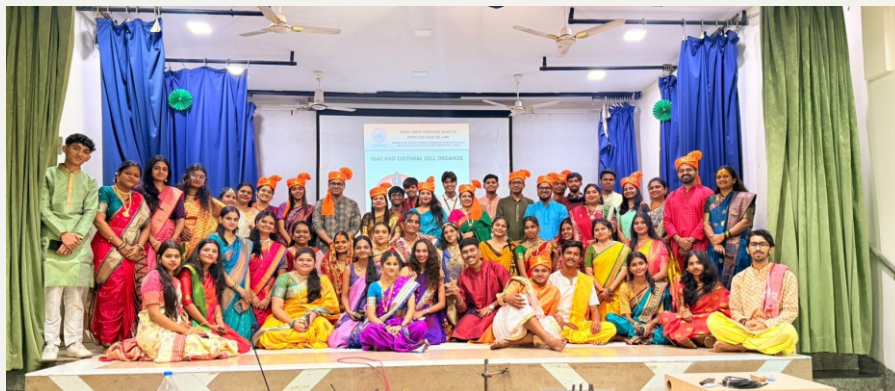
MARATHI BHASHA GAURAV DIN