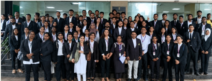
MAZGAON COURT VISIT