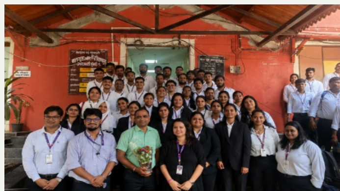
JUVENILE OBSERVATION HOME VISIT DONGARI