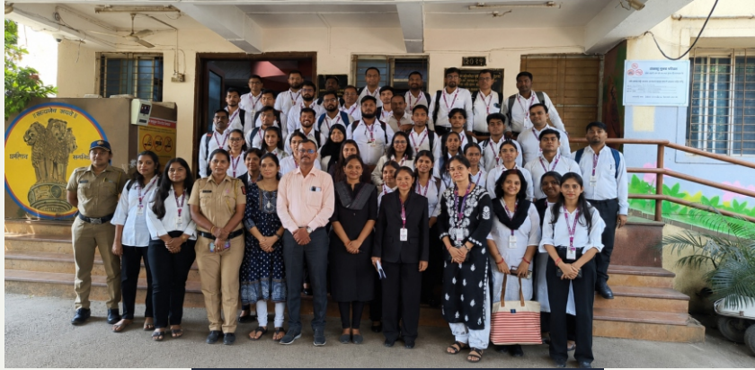
POLICE STATION VISIT