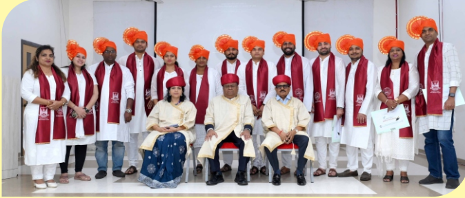
Hon'ble Justice Milind Jadhav (Bombay High Court) delivered a keynote-address at the Convocation ceremony