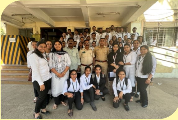
POLICE STATION VISIT