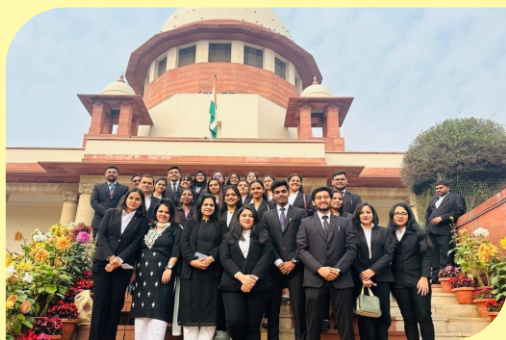
SUPREME COURT VISIT