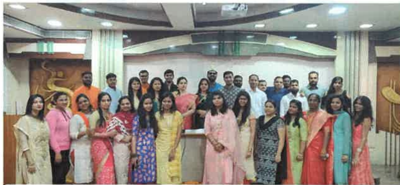
T. Y. LLB 2019-20