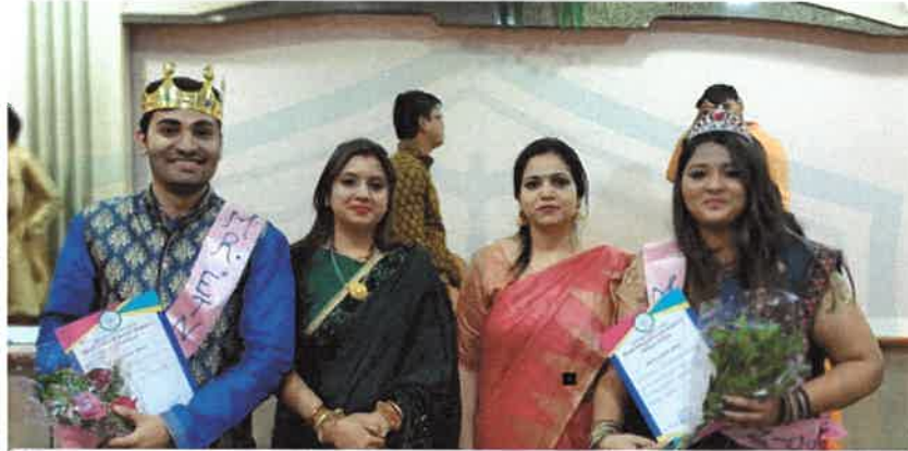
Mr. and Miss. Etnica 2019-20